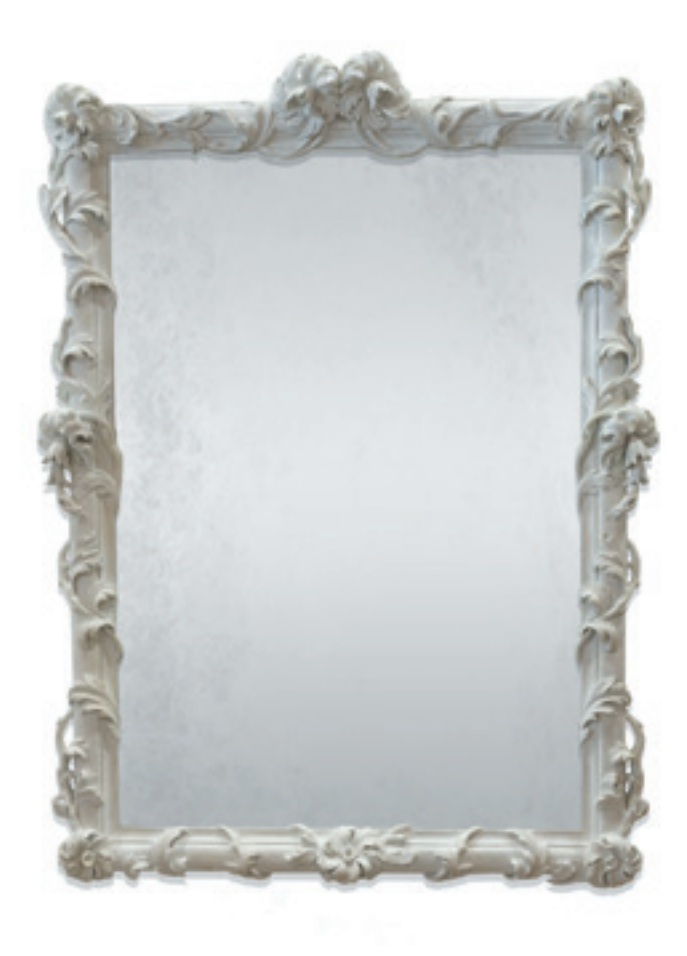
AM007 ANTIQUE WHITE & ORIGINAL MIRROR PLATE 138CM [54.3"] HEIGHT X 107CM [42.1"] WIDTH X 8CM [3.1"] DEPTH

Crafted in France in circa 1880, this piece features an intricate foliate design hand carved into its wooden frame that has been carefully refurbished by one of our master restorers in an antique white finish. This piece also includes it's 142 year old original mirror plate.