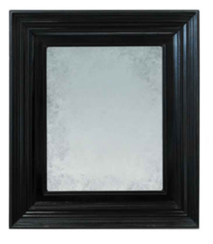
AM016 EBONISED FRAME & NEW DISTRESSED MIRROR PLATE 91CM [35.8"] HEIGHT X 80CM [31.5"] WIDTH X 8CM [3.1"] DEPTH

Manufactured in France, circa 1860, this classic rectangular mirror has been wonderfully cleaned to highlight the fine ebonised, carved wooden frame, which is of superb quality. While it is unknown who invented ebonising, the process became extremely popular in the early 19th century as ebony wood was no longer plentiful enough to meet demand.