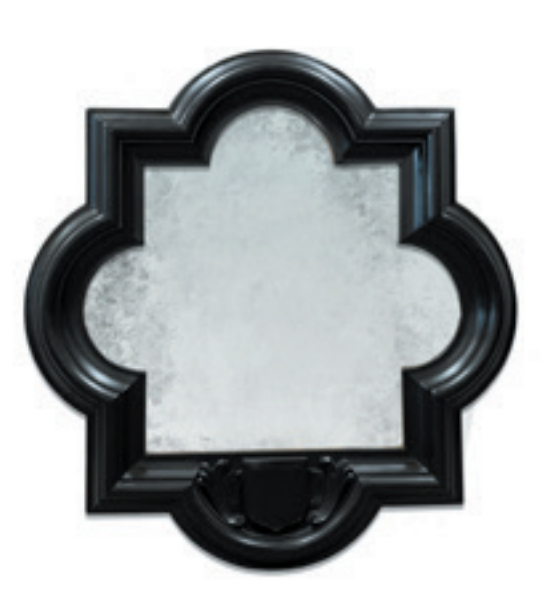
AM013-BLACK ANTIQUE BLACK & NEW DISTRESSED MIRROR PLATE 128CM [50.3"] HEIGHT X 128CM [50.3"] WIDTH X 10CM [4"] DEPTH

Traced to France, circa 1850, these mirrors feature new, distressed mirror plates and a very distinct shape that was a popular period design. In a fortunate turn of events, there are two pairs available, one in antique black and one in antique white. The central plaque on each piece can be initialled to order by our master restorers for an added personal touch.