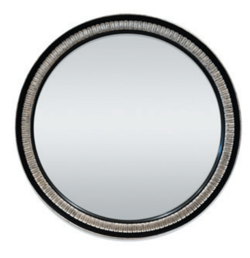
AM014 EBONISED FRAME WITH SILVER GILT & NEW DISTRESSED MIRROR PLATE 115CM [45.2"] DIAMETER X 8CM [3.1"] DEPTH

At over 150 years old, this piece features a new distressed mirror plate and an ebonised, carved wood frame with the classic egg-and-dart design picked out in silver gilt. Originally crafted in Italy, circa 1870, this exceptional piece would fit into both traditional or contemporary interior settings.