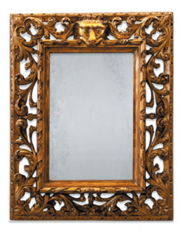
AM004 GILDED FRAME & ORIGINAL MIRROR PLATE 117CM [46"] HEIGHT X 93CM [36.6"] WIDTH X 9CM [3.5"] DEPTH

A fantastic example of Florentine craftsmanship, this piece from circa 1740 includes an intricately carved giltwood frame with a fabulous lions head as its centerpiece. This small slice of history has stood the test of time and also includes its original mirror plate. Our experts believe that this incredible mirror has spent most of it's 280 year lifespan in the same position, which accounts for it's unbelievable condition.