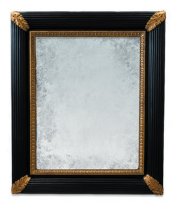
AM018 EBONISED AND GILDED FRAME & ORIGINAL MIRROR PLATE 126CM [49.6"] HEIGHT X 107CM [42.1"] WIDTH X 8CM [3.1"] DEPTH

Hand carved in Italy, circa 1820, this fabulous mirror features its authentic mirror plate and a reeded frame design with ebonised wood and gilded detailing. Historically hardwoods, such as walnut, were ebonised due to their higher content on tannins. However, it was soon realised that lighter softwoods could also be ebonised by soaking them in tea before treating.