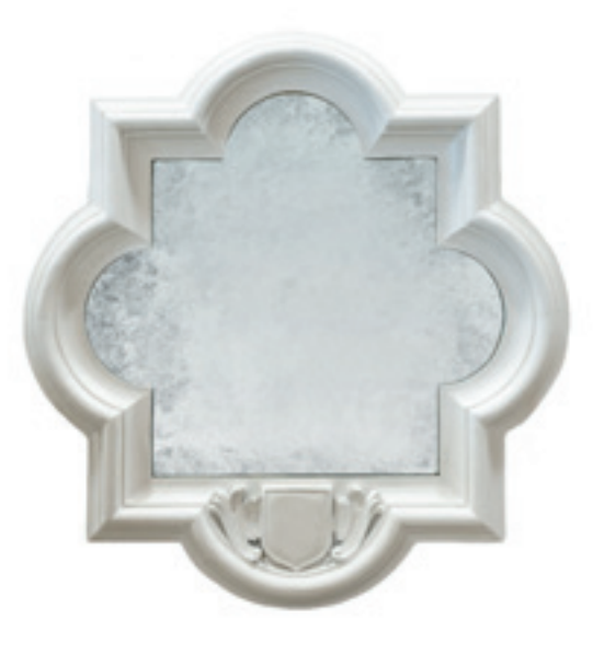
AM013-WHITE ANTIQUE WHITE & NEW DISTRESSED MIRROR PLATE 128CM [50.3"] HEIGHT X 128CM [50.3"] WIDTH X 10CM [4"] DEPTH