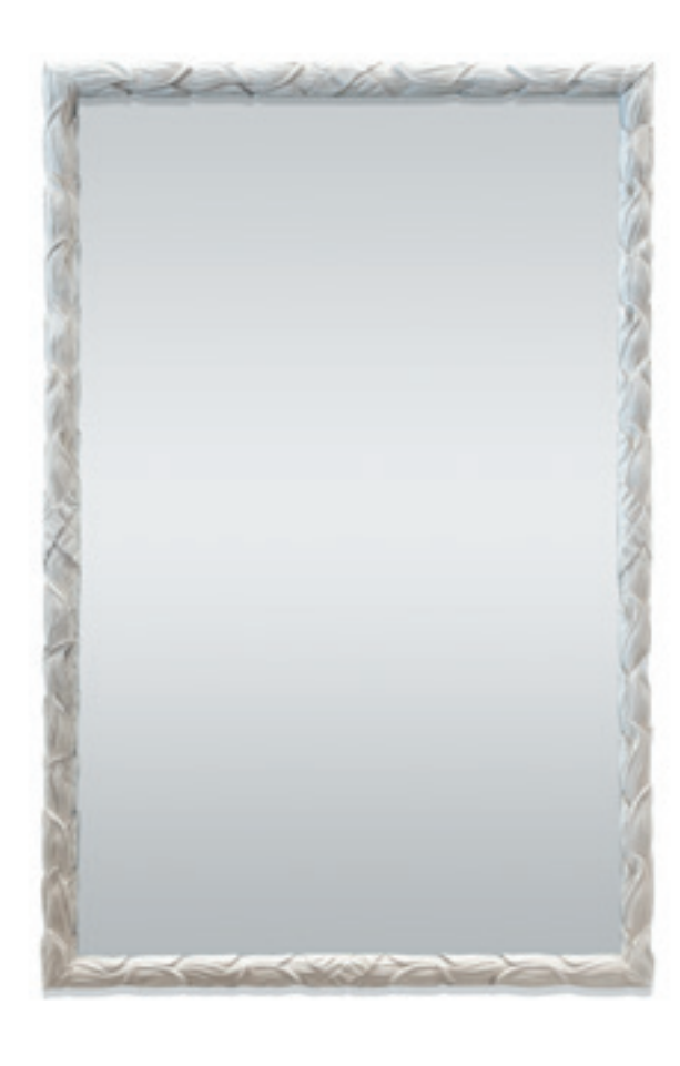
AM009 ANTIQUE WHITE & ORIGINAL MIRROR PLATE 161CM [63.4"] HEIGHT X 104CM [50"] WIDTH X 5CM [2"] DEPTH

Symbolising immortality and resurrection, the acanthus leaf design seen on the frame of this piece from England, circa 1825, has been an incredibly important and popular design for thousands of years. Featuring its original mirror plate, the frame has been carefully refurbished in antique white.