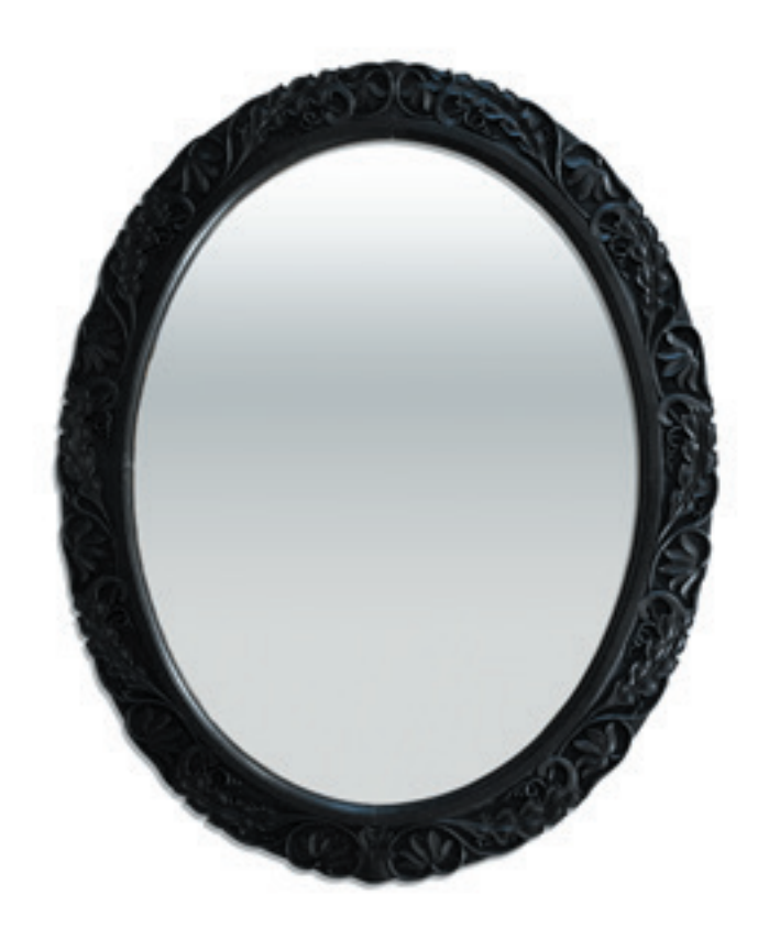
AM015 EBONISED FRAME & ORIGINAL MIRROR PLATE 159CM [62.6"] HEIGHT X 128CM [50.3"] WIDTH X 4CM [1.6"] DEPTH

This large, oval mirror dates back to England, circa 1860, and features a superb, floral design hand-carved into the ebonised walnut frame. Featuring it's original mirror plate and with brackets on both the horizontal and vertical edges, this mirror can be orientated however desired to showcase its timeless beauty.