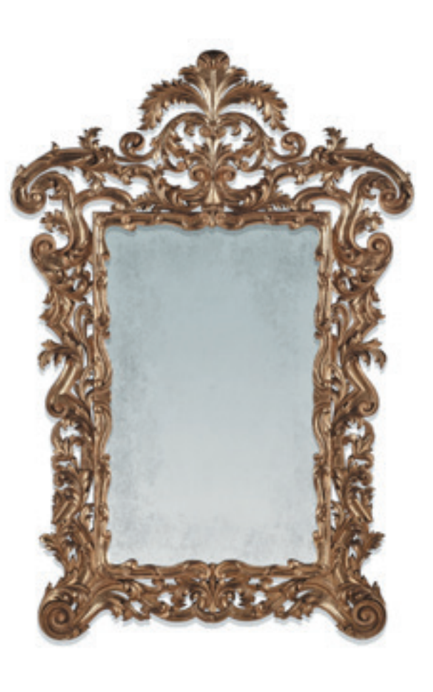
AM001 GILDED FRAME & NEW DISTRESSED MIRROR PLATE 250CM [98.4"] HEIGHT X 173CM [68"] WIDTH X 20CM [8"] DEPTH

Truly a one-of-a-kind, this exceptional mirror traces its roots to Italy, in circa 1760, where it was hand carved and gilded in either Florence or Rome. Due to the age, size and quality of the piece, our experts believe that this mirror was made for a major Italian palazzo. At over 250 years old, the gilded frame has been masterfully cleaned, partially re-gilded and the mirror glass has been replaced with a new, high quality distressed plate.