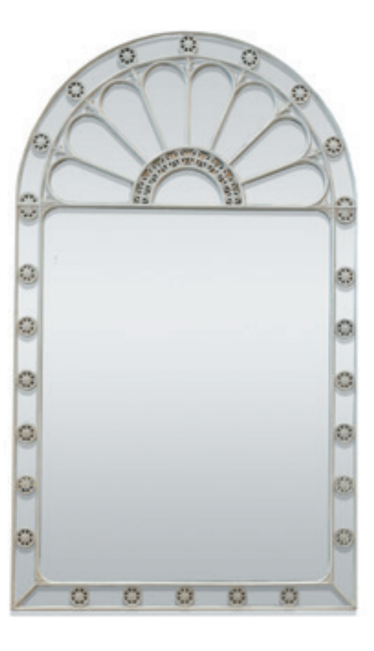
AM008 ANTIQUE WHITE & ORIGINAL MIRROR PLATE 170CM [66.9"] HEIGHT X 102CM [40.1"] WIDTH X 5CM [2"] DEPTH

One of the largest mirrors in the Vintage range, this Italian piece from circa 1880 features a unique dome topped, rectangular shape. Combining this with the delicate, carved wood frame in antique white set on top of the mirror plate creates the illusion of staring through a traditional, segmented window that were common in buildings in the 1800s.