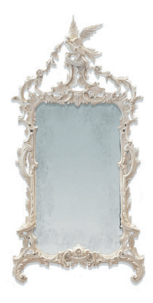
AM011 ANTIQUE WHITE & ORIGINAL MIRROR PLATE 162CM [63.8"] HEIGHT X 82CM [32.3"] WIDTH X 10CM [4"] DEPTH

This Italian piece, circa 1890, features a delicate and intricately carved frame with a large ho ho bird as the centerpiece that was popular in the Rococo style of the period. The ho ho bird comes from the mythical Japanese version of the phoenix that was said to bring good fortune and longevity. This piece includes its original mirror plate with a masterfully refurbished frame in antique white.