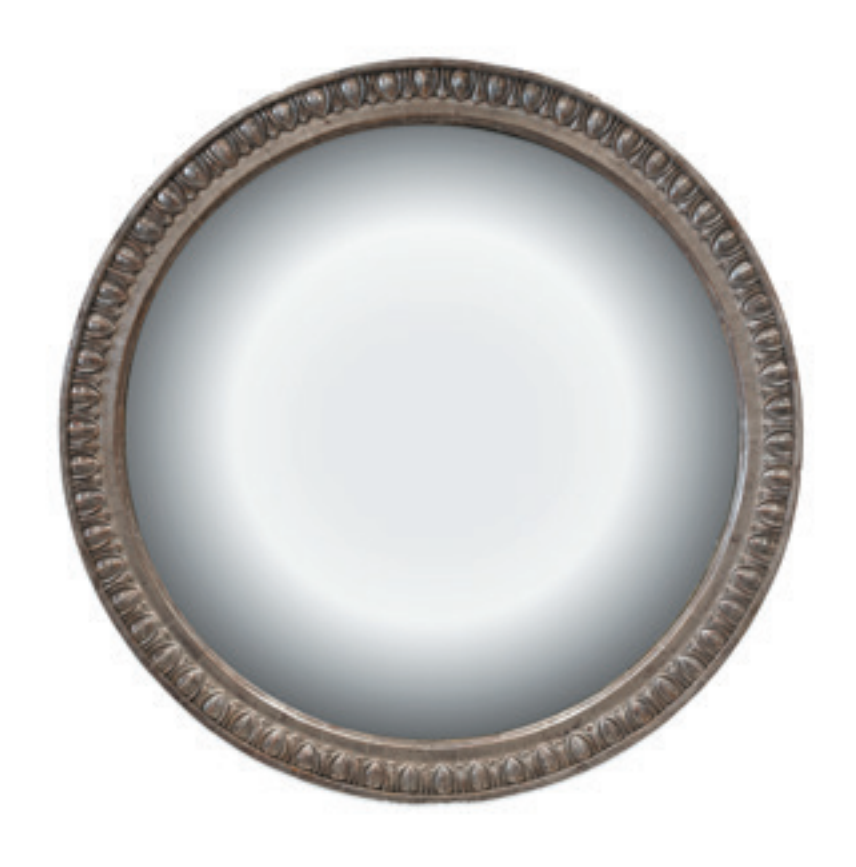
AM017 SILVER GILT FRAME & ORIGINAL CONVEXED MIRROR PLATE 140CM [55.1"] DIAMTER X 6CM [2.4"] DEPTH

Originally a feature of the Ionic order, one of the three canonic orders of classical architecture, the egg-and-dart design used on this beautiful, silver gilt frame regained popularity in the neoclassical era starting in the mid 18th century. Dating back to circa 1900, this wonderful piece of English origin also includes an original, slightly convexed mirror plate in excellent condition.